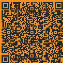
TATM Toolbox #1