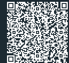
TATM Toolbox #3