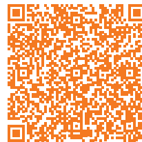
TATM Toolbox #2