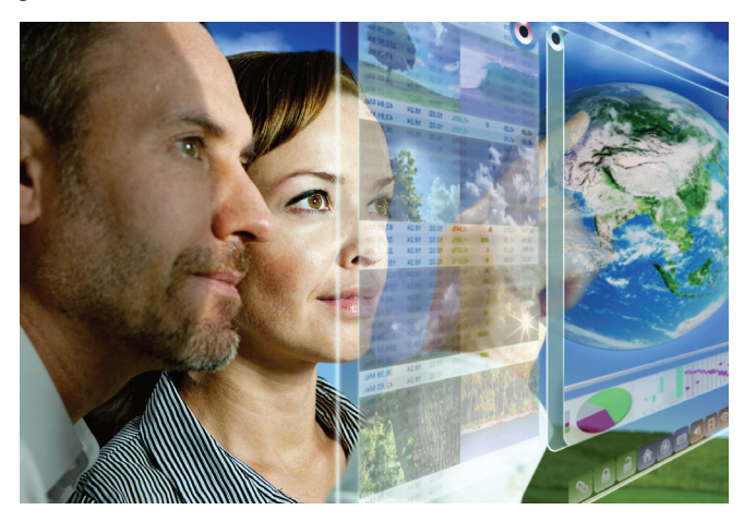
Theme 3.3: Culture of Fairness, Equity, and Inclusion

A more diverse and inclusive workforce provides critical foundations for fostering innovation. Organizations recognized for their innovative approaches to problem solving have sustained their ability to take risks and mobilize innovation by making it part of their culture.