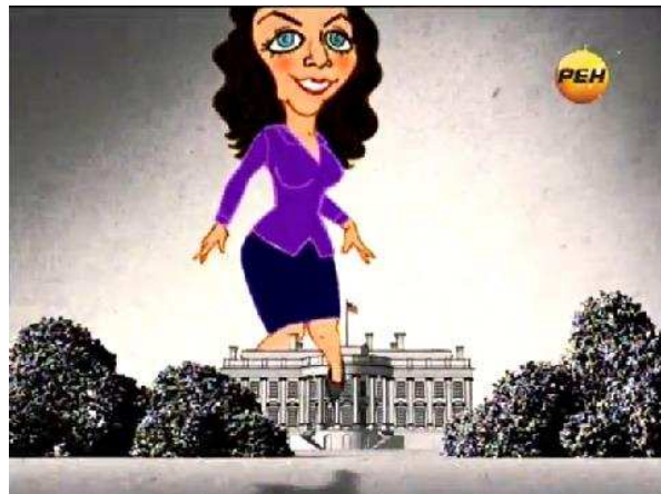
Simonyan steps over the White House in the introduction from her short-lived domestic show on REN TV (REN TV, 26 December 2011)