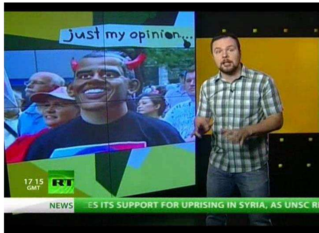
Messaging on RT prior to the US presidential election (RT, 3 November)