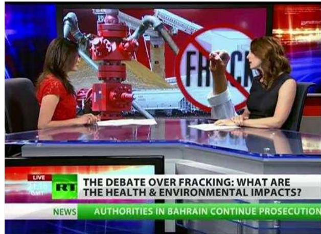
RT anti-fracking reporting (RT, 5 October)