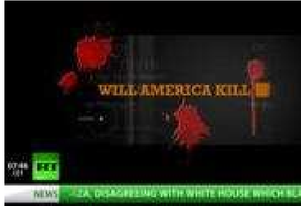
RT new show "Truthseeker" (RT, 11 November)