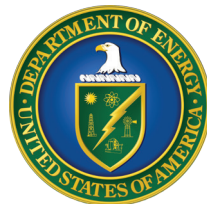
Department of Energy Office of the Inspector General