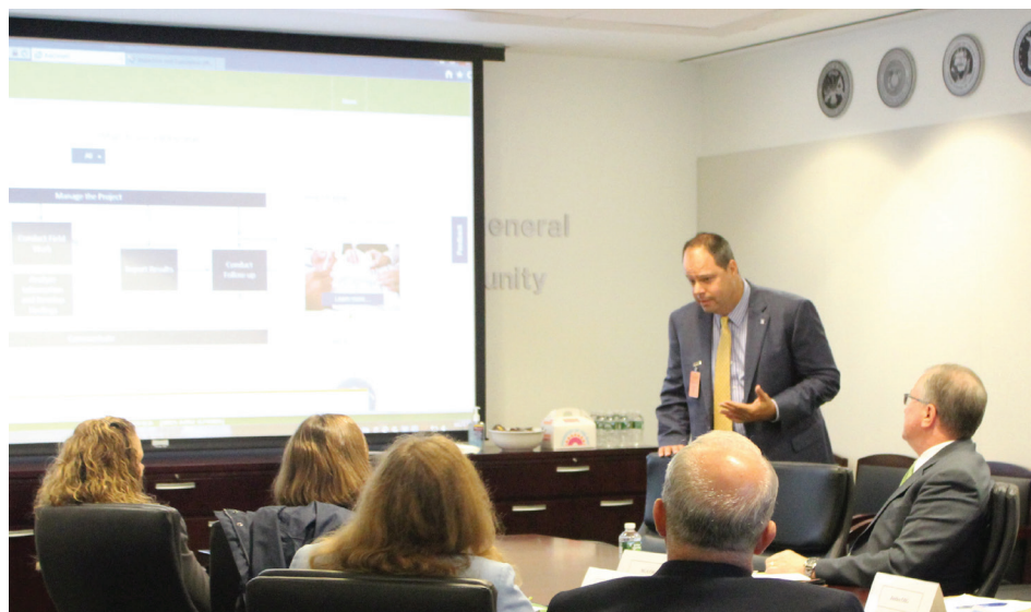
A CIGIE Training Institute staff member discusses an online tool and methodology currently under development.

from several OIG I&E offices are consulting on its development. Committee members generally agreed that the I&E Navigator, scheduled to be completed in late FY 2019, has the potential to be a helpful tool for inspectors in accomplishing their I&E oversight mission. CIGIE anticipates developing similar tools for investigations, audits, and OIG leadership.