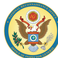
National Reconnaissance Office Office of the Inspector General