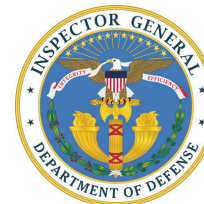
Department of Defense Office of the Inspector General