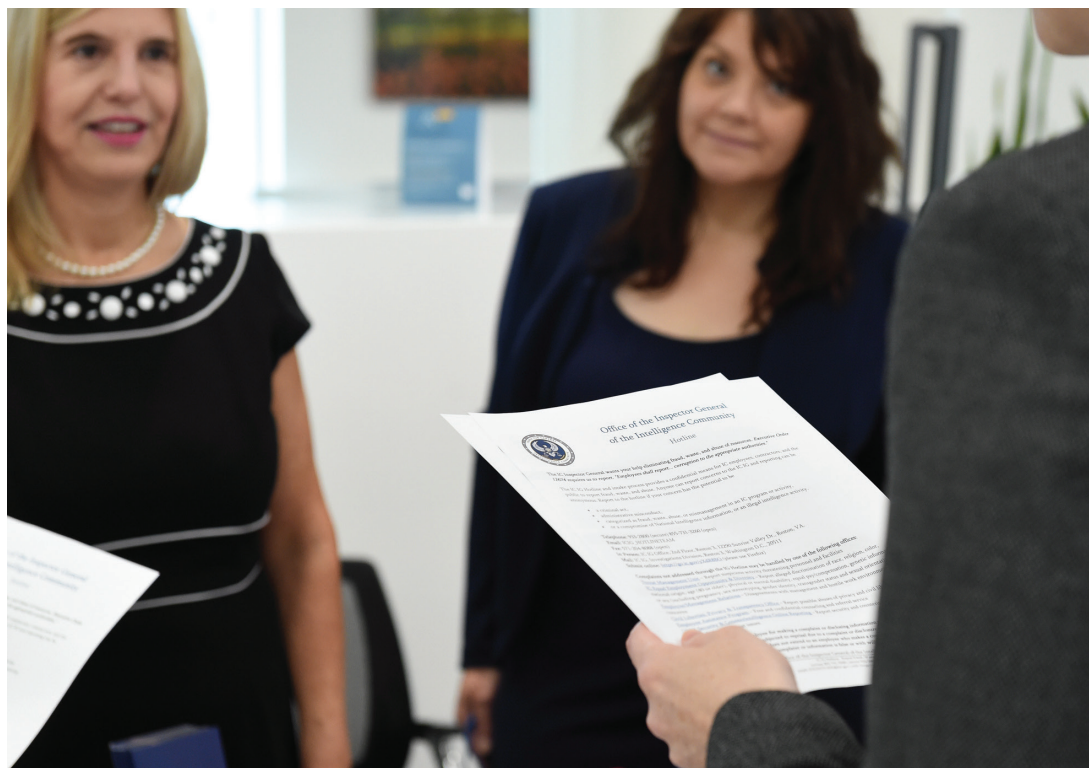
ICIG staff sensitize IC employees about reporting obligations during a National Compliance Officer Day observance in September.

personnel through various elements of the IC in an effort to foster a broader community perspective, and to provide IC civilian joint duty qualifying experience(s) to those civilian personnel in the course of their careers. Preliminary discussions with the Deputy Inspectors General of the other Forum members have begun. The Committee anticipates addressing this topic at their next meeting in the first quarter of FY 2019, and providing their work for consideration by the Inspectors General at a future Forum session.