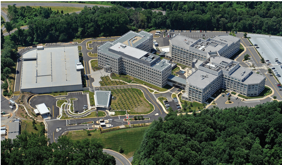
The ICIG maintains a satellite office at ODNI's headquarters at Liberty Crossing.

The Investigations Division has begun to work with ODNI and the other IC elements and stakeholders to develop a program to meet the ICIG's obligations under ICD 701. The Investigations Division will begin to implement this new program during the next reporting period.