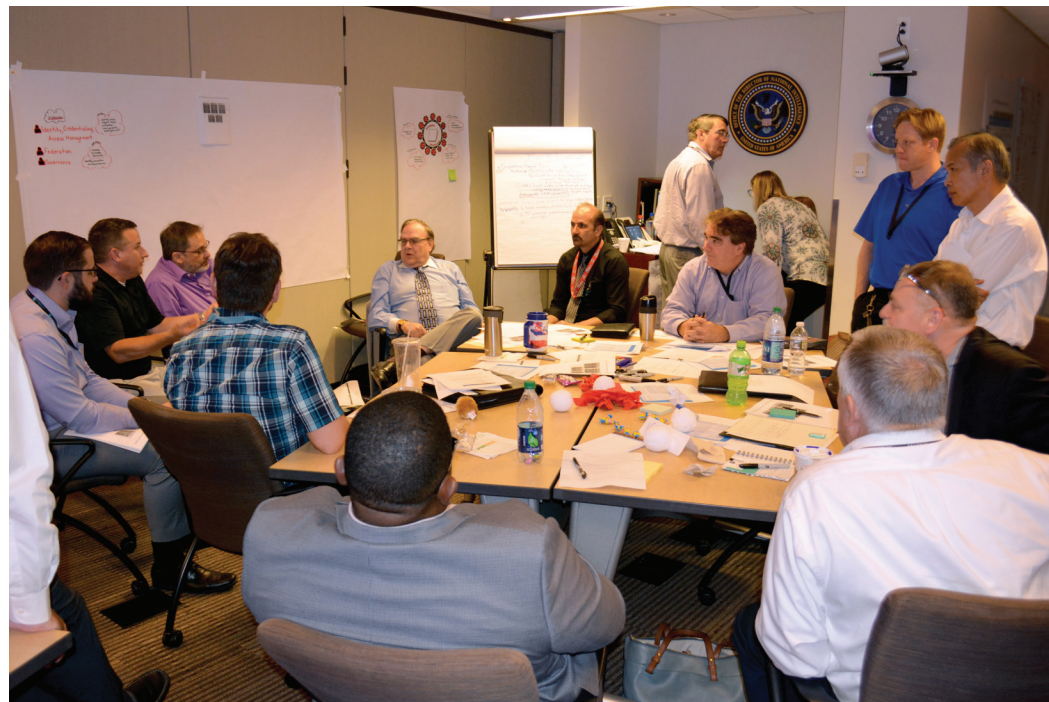
Intelligence Community IT professionals collaborate to discuss identity, credentials, and access management (ICAM) requirements to produce a community-wide ICAM reference architecture at an offsite held at ODNI.

The ICIG Audit Division and the National Reconnaissance Office OIG co-hosted the second Intelligence Community Information Technology Auditor Summit. The summit featured the IC Chief Information Officer's insight on strategies and challenges in IT developments for the IC. Speakers from across the community shared information on current topics including the use of data analytics for IT audits, privacy controls in the IC, and mitigating security and counterintelligence risks in the IT supply chain. Roundtable discussions provided participants the opportunity to share ideas on approaches and best practices, and to discuss challenges in conducting IT audits.