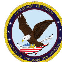
Department of Justice Office of the Inspector General