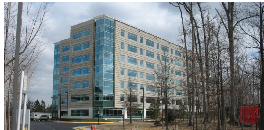
The ICIG's main offices are located at 12290 Sunrise Valley Drive, Gate 3, Reston, VA 20191.

Finally, as always, I sincerely thank the employees and contractors at the ICIG for their integrity, hard work, and commitment to the ICIG's mission.