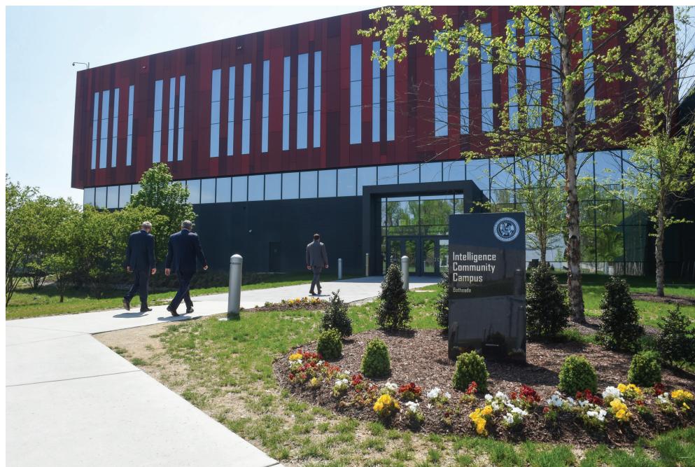
The Intelligence Community Campus in Bethesda, Maryland (ICC-Bethesda). The ICIG maintains a satellite office at ICC-B.

OGC continues to review and monitor proposed legislation and regulations potentially affecting ICIG operations specifically and the broader Inspector General community generally. Further, OGC regularly engages with congressional staff to discuss pending and potential legislation. For example, OGC closely tracked and commented on the House and Senate Intelligence Authorization Acts of 2018 and 2019, and discussed with staff the need for legislation aimed at enhancing the ICIG's ability to recruit and retain experienced investigators.