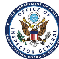
Department of State Office of the Inspector General