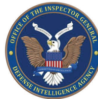
Defense Intelligence Agency Office of the Inspector General